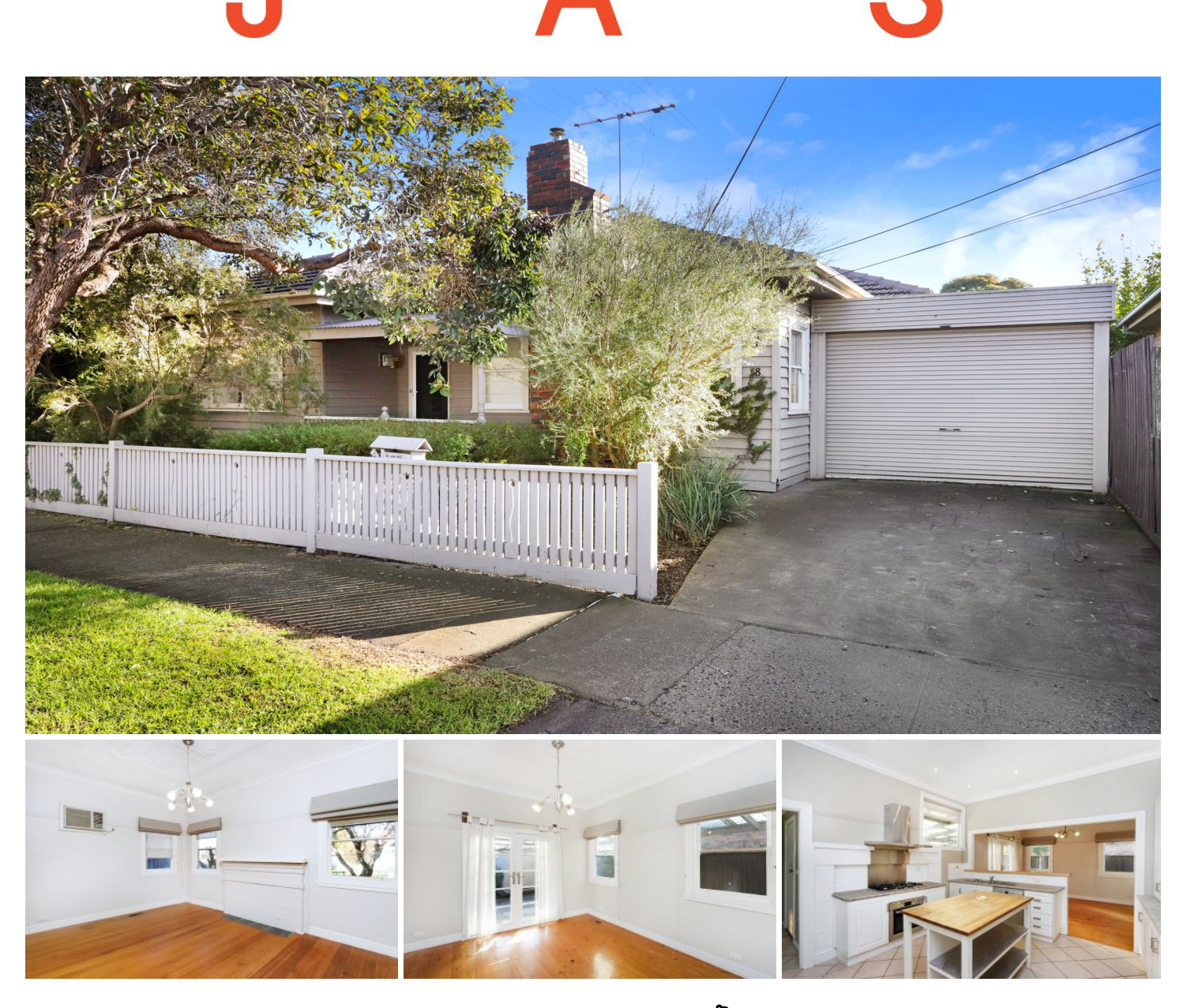
18 Howard Street Maidstone VIC

Enjoy this charming & relaxed family home, north-facing rear aspects offering a sheltered terrace featuring charming wisteria, native and low maintenance garden with an add on appeal of undercover outdoor living in close proximity to all essential amenities.